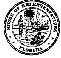
MARCO RUBIO Speaker of the House of Representatives