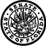
KEN PRUITT President of the Senate